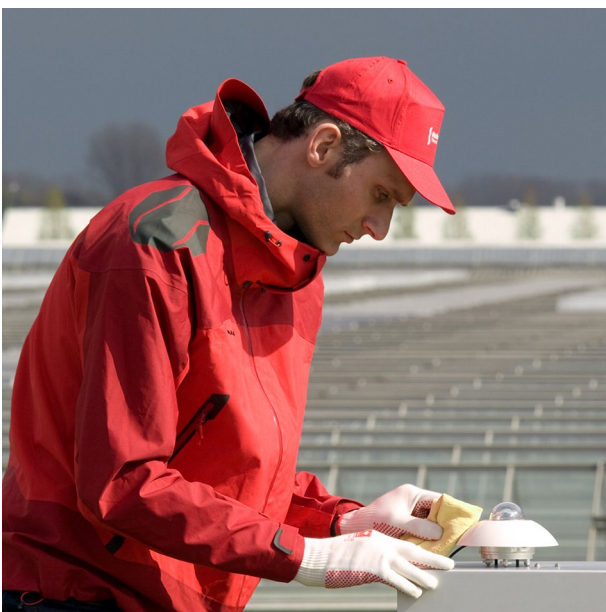
Figure 2 SR11 pyranometer in greenhouse application