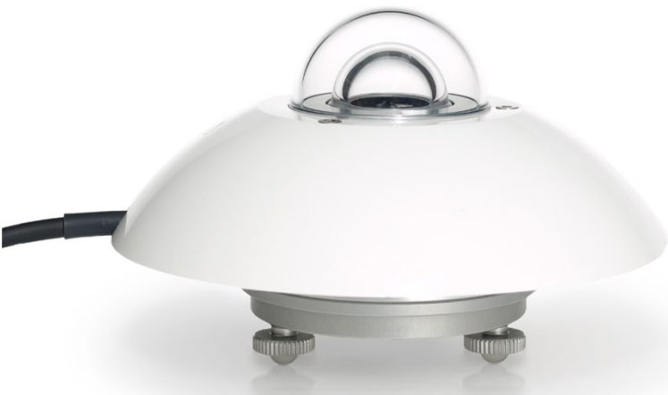
Figure 1 SR11 first class pyranometer

SR11 is a high accuracy solar radiation sensor. SR11 first class pyranometer complies with the first class specifications of the ISO 9060 standard and the WMO Guide. It is the preferred instrument for outdoor PV system performance monitoring, according to the ASTM E2848 standard.